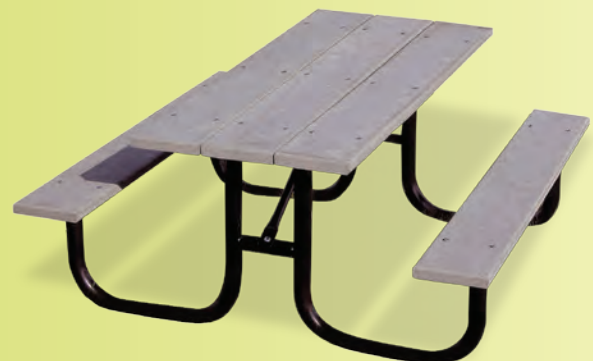
158-GRY8 8' Portable Gray Recycled Plastic Heavy-Duty Rectangular Table

100% recycled plastic planking with green color