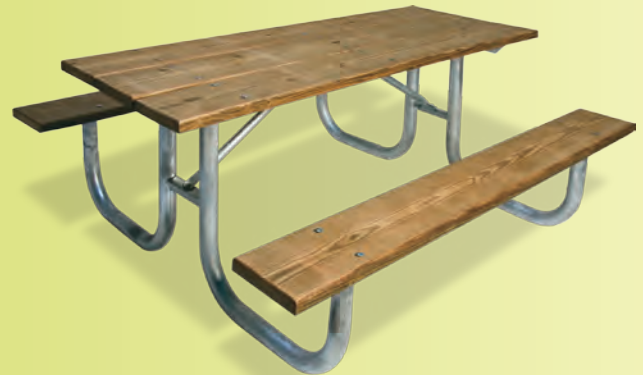
238-PT6 6' Portable Rectangular Table